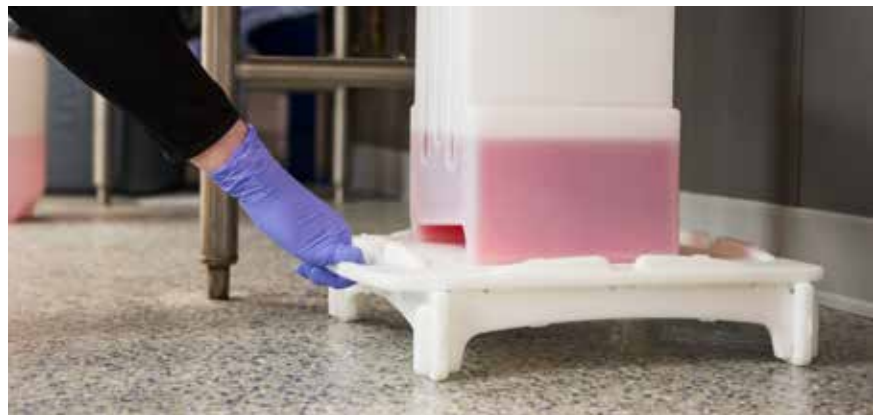
L12X1 – LOCKABLE RACK