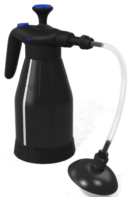
0.4 Gallon Foam Unit with Drain Attachment F1.5L-DP3.75

Table and bar top sanitation made easy with this ergonomic alternative to traditional trigger sprayers. Spray in any direction, even upside down.