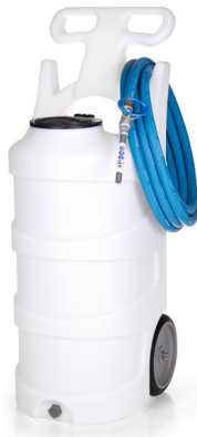
20 Gallon Foam Unit with Zero and Fan Tip Wands FI-20N-QCW

Safely transfer chemical without hand drum pumps. Unit may be configured for up to four pumps.