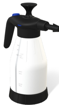
0.4 Gallon Spray Unit SP1.5L

Sanitize tap room basket floor drains with this hand held unit. Also great for window and spot cleaning.