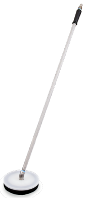
Trench Drain Foaming Attachment DFA-TR7

Color coded cap and jug body options make chemical identification easy.