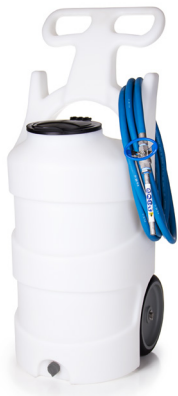
10 Gallon Foam Unit with Zero and Fan Tip Wands FI-10N-QCW

This portable unit can throw foam far enough to clean brew tanks 10-20 feet tall.