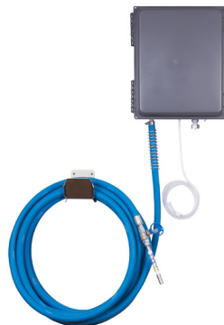
Concentrate Foam Unit FI-WC

Get 360 degree pipe wall contact for complete drain sanitation with a portable unit attachment.