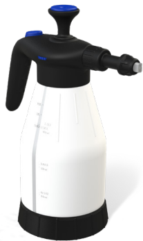
0.4 Gallon Foam Unit F1.5L

Sanitize tap room basket floor drains with this hand held unit. Also great for window and spot cleaning.