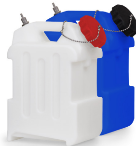
2.5 Gallon Chemical Jug 5 Gallon Chemical Jug J2.5BKSR & J5BKSR

Need something bigger? Our 20 gallon unit can reach tanks 20-30 feet tall.