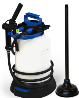
1.3 Gallon Foam Unit with Drain Attachment F5.0L-DF

Light enough to be carried on a brewer's platform, this unit can be pressurized with compressed air and moved to the area to be cleaned.