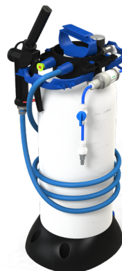
2.6 Gallon Dual-Power Foam Unit F100

Prevent fruit flies and odors with a 3.75 inch attachment that covers sink drains for complete kitchen sanitation.