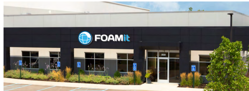
*Logo reversal exception on building signage